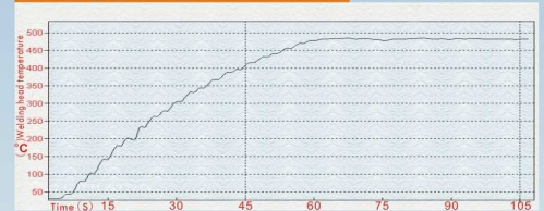
Heating curve determination:

Heater fail notification: When the heater failed, "H-E" will Be shown, SIA will power off